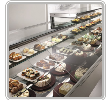
VERTIGO 2 Pastry