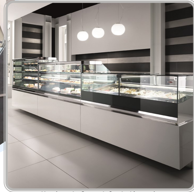
Vertigo 1, 2, and 3 shelf versions