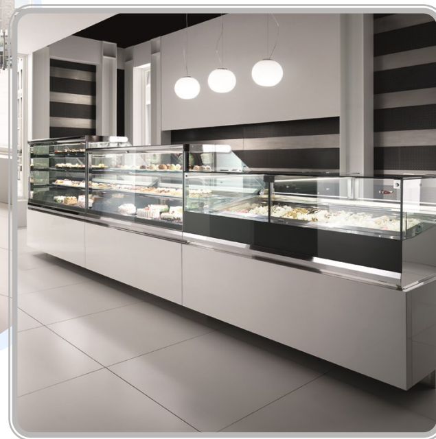
Vertigo 1, 2, and 3 shelf versions